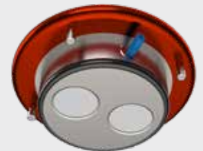
SmartDS - MEX Detector (Bottom)