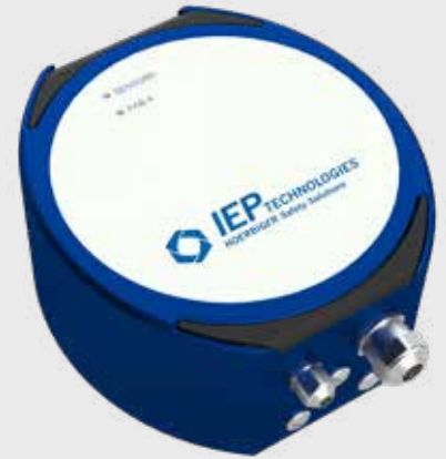
SmartDS - FAB 4